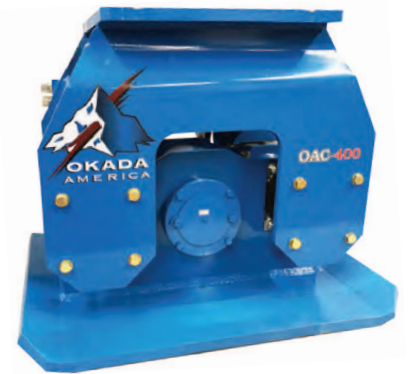
OAC400 Available with optional Backfill Blade