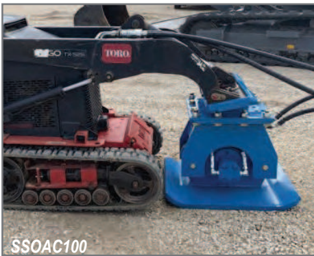
SSOAC100 24" wide tamper base plate, suitable for compact utility loaders.