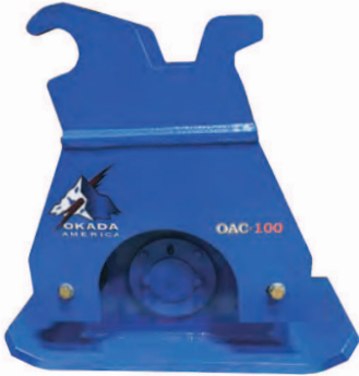
OAC100 12, 16 & 18" tamper plate width standard sizes