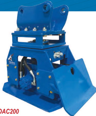
OAC200 Shown with optional Backfill Blade and Swivel