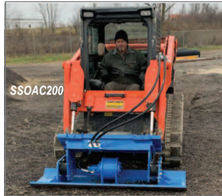
SSOAC200 72" wide tamper base plate, suitable for skid steer loaders.